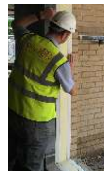
Double Standard-Retro fitted