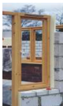
Standard-Fixed to the frame and built in